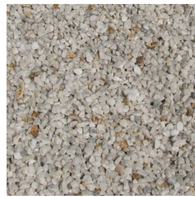
Arctic white gravel