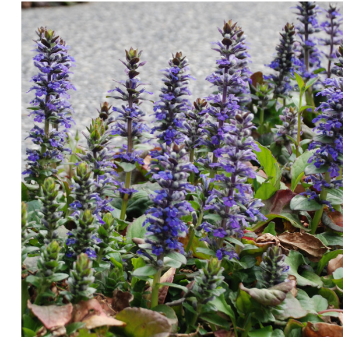
Ajuga reptans 'Tuff and Tidy'