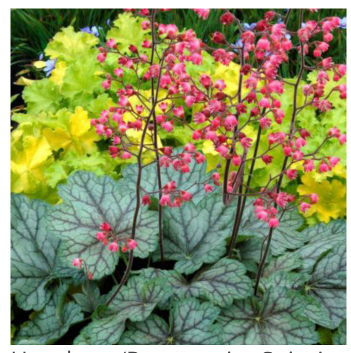
Heuchera 'Peppermint Spice'