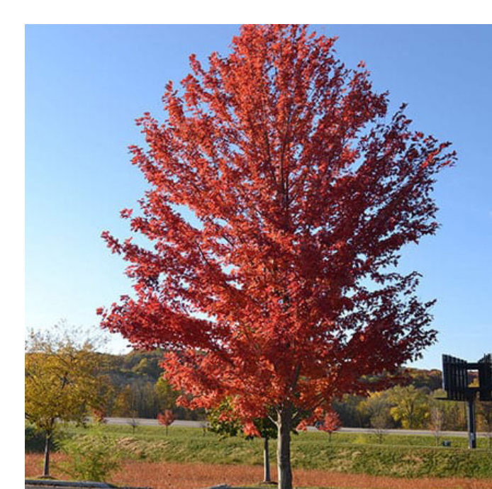
Acer freemanii 'Autumn Blaze'