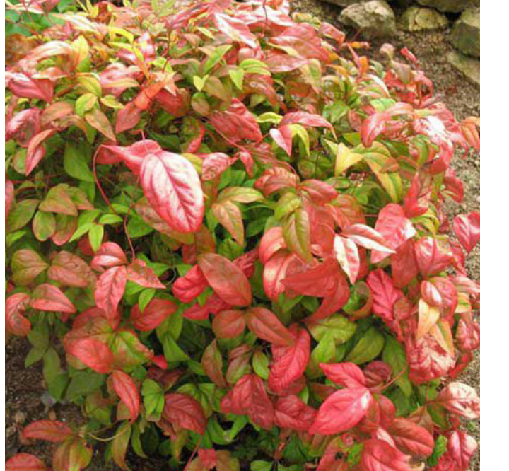
Nandina domestica 'Nana'