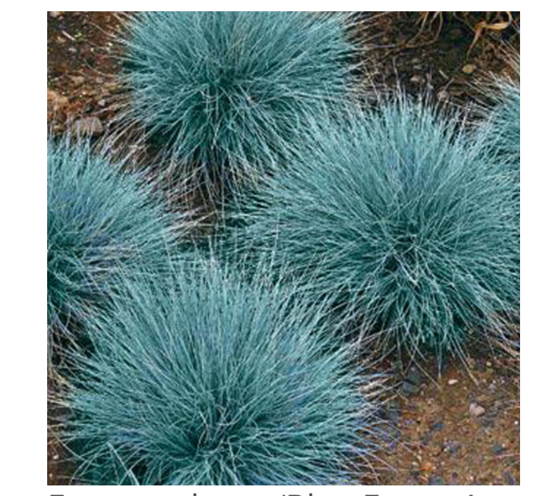
Festuca glauca 'Blue Fescue'