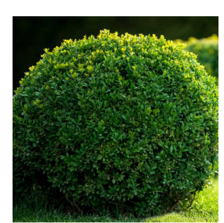
Buxus sempervirens 'Ball'